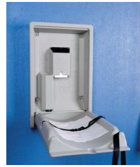
Model KB101-00 Cream Color (米色)